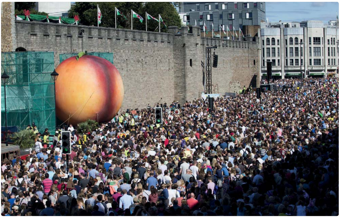
Roald Dahl's City of the Unexpected. Wales Millennium Centre and National Theatre Wales

The public rightly demands that the institutions they fund are efficient and cost effective. The Arts Council of Wales distributes public funding. So while we must first of all demonstrate the public benefit that our work delivers, and the difference we're making to the quality of the arts in Wales, we must also show that we deliver value for money for the Welsh taxpayer.