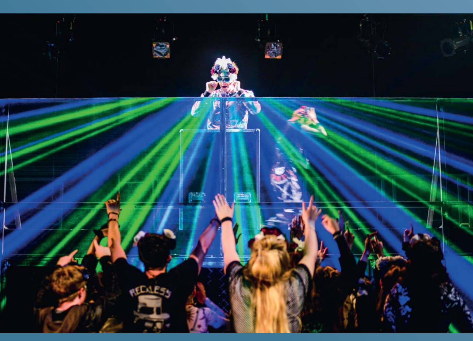
National Youth Arts Wales